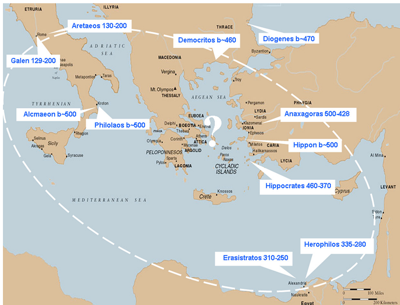
FIG. 1. Map of the eastern Mediterranean with the cities of the ancient era of 5th century BC to 2nd century AD. The names of philosophers who advanced the encephalocentric view are depicted along with a pointer to the place of their teaching. b~ stands for born circa. It is astonishing that these advances, which founded neuroscience, were made entirely in the periphery of the ancient Greek world, while at the center, the giants of philosophy were either little interested (Plato) or negative (Aristotle's cardiocentric view). Why?